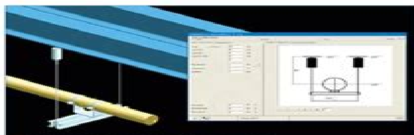
AVEVA MDS with Manufacturer Interface for Ulsaga - Ulsag