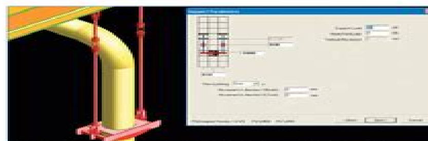
AVEVA MDS with Manufacturer Interface for Pipe Supports Limited - PSDesigner