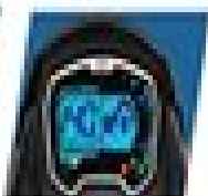
DIGITAL METER WITH CLOCK & FUEL GAUGE