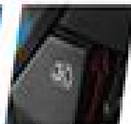
110cc SUPERIOR ENGINE