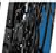
POWERFUL DISC BRAKE