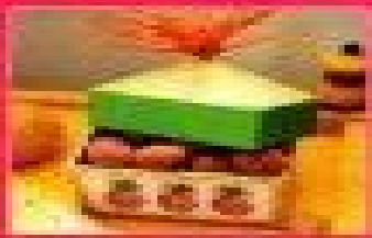
CAP SUR L'ÉCRAN !

Des pas-à-pas, des reportages, des suggestions