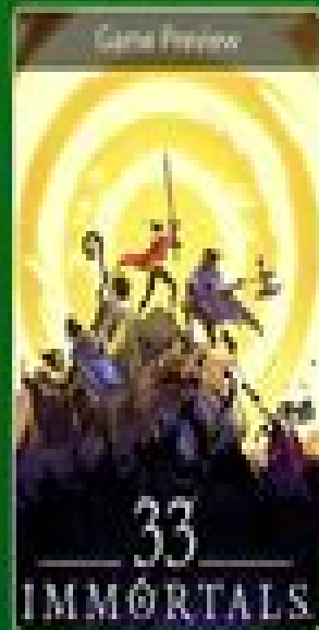
ULTIMATE, PC Also Series 30 • PC • Cloud