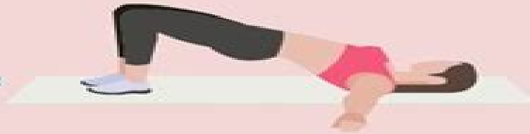
2. PILATES BRIDGE