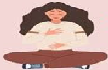
1. WARM-UP: PILATES BREATHING