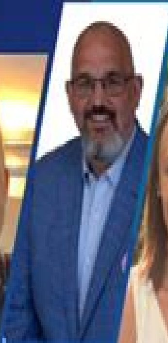
BRETT SALAKAS AP Education