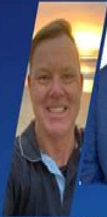
ANDY HAIR ACHSES VM