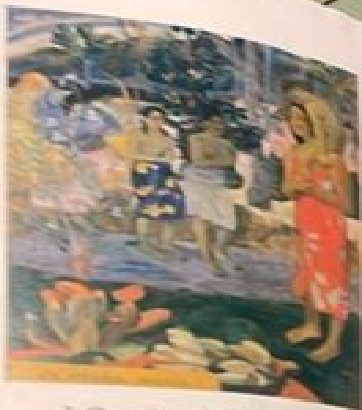
La Corona Maria (Fait Mary), 1891