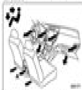
2. Models with rear ventilators

Ventilation: Instrument panel outlets and foot outlets