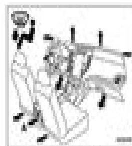
4. Models with rear ventilators

Heat: Foot outlets, both side outlets of the instrument panel and vents through wind-shaped outdoor outlets (a small amount of air flows to the windshield and both side windows to prevent fogging.)