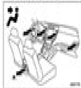
4. Models with rear ventilators

Ventilation: Instrument panel outlets and foot outlets