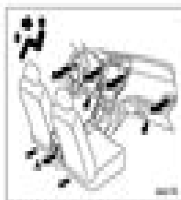
1. Models with rear ventilators

Ventilation: Instrument panel outlets and foot outlets