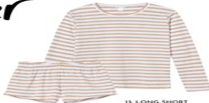
13. LONG SHORT PAJAMA SET