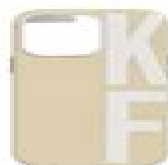
15. LEATHER PHONE CASE