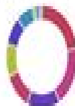
Destination (flow records)