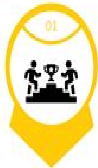
Competitive Negotiation Games