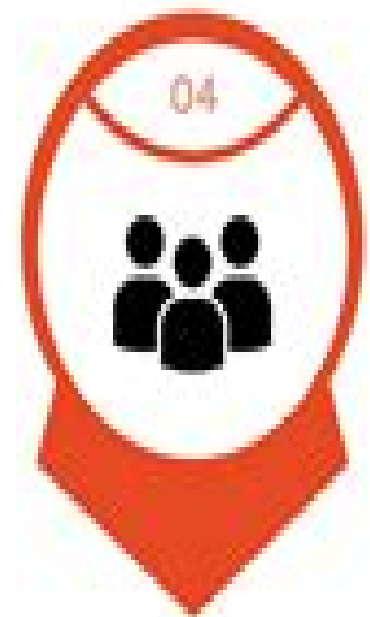
Multi-player Negotiation Games