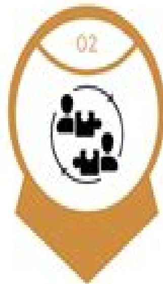
Collaborative Negotiation Games