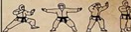
IHEN HIDARI HIRA ICHI MONJI HOKO KONGO GASSHO