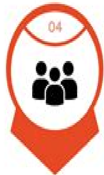
Multi-player Negotiation Games