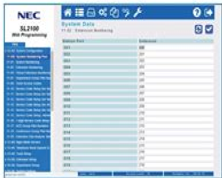
WebPRO/UserPRO (New GUI)