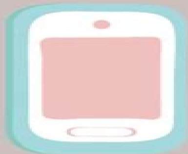
go screen free for 30 minutes