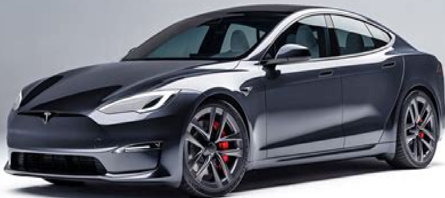
2024 Tesla Model S shown