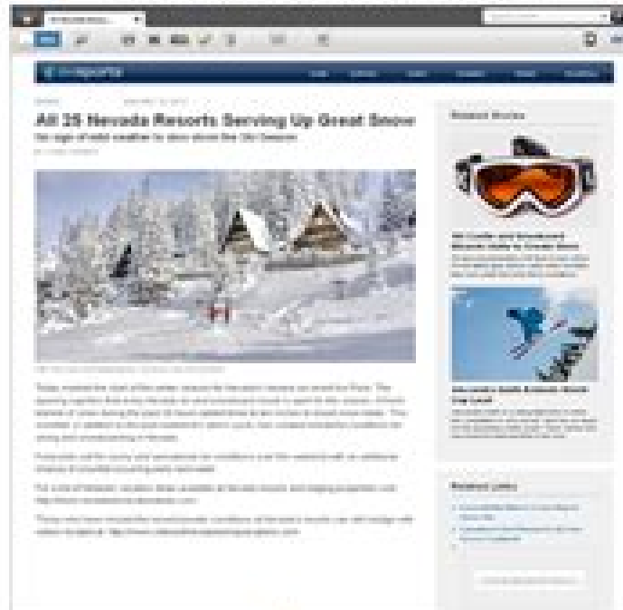
Web Mode: Web page view of a content entry form

Content entered into the content entry form (in Form Mode or Web Mode) is stored as a record in the CM system database.