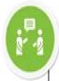
The Anchoring Technique