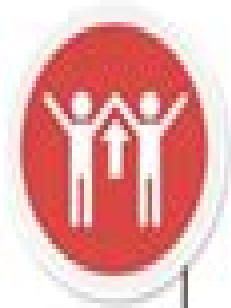
The Win-Win Approach