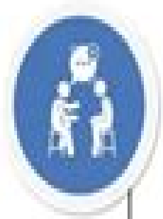
The Nibble Technique