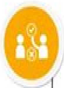
The BATNA Strategy