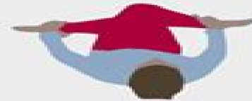
RECLINING COW FACE