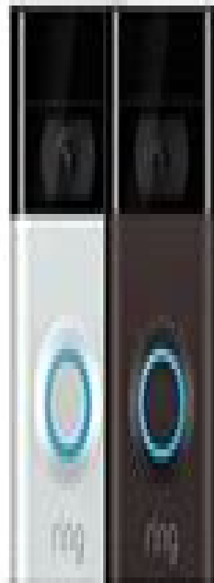
Ring Video Doorbell 2