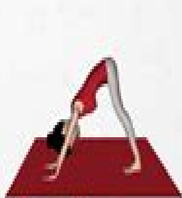
Adho Mukha Savasana