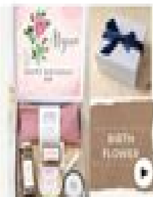
Birth Flower Birthday Gift Box, Personalized birthday ideas...