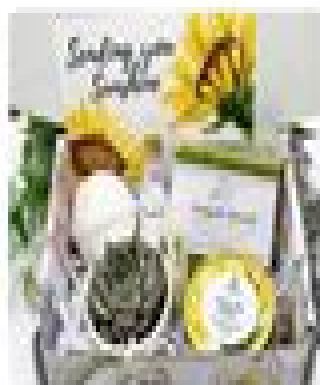
Thinking of You - Succulent Gift Box - Missing You - Friendship...