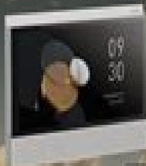
Panel Hub S1 Plus US