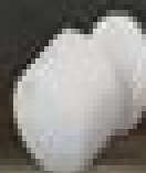
Presence Sensor FP300