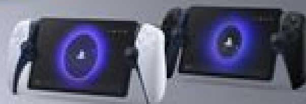
PlayStation®Portal™ Remote Player™

*PlayStation®5 Console and Wi-Fi required