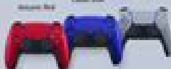
Special Edition Collection