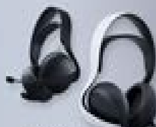
PULSE™ Elite™ Wireless Headset