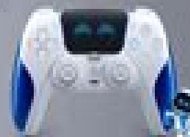
DualSense™ Wireless Controller - Astro Bot Joyful Limited Edition™

*PlayStation®5 Console and Wi-Fi required