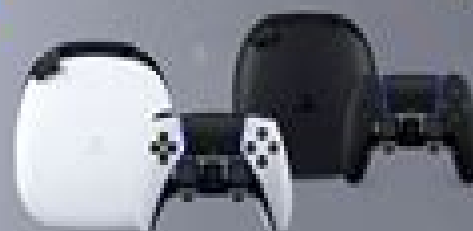
DualSense™ Edge™ Wireless Controller