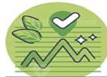
PLAN ACCORDING TO TRESHOLDS