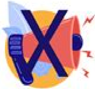
Reduce the noise