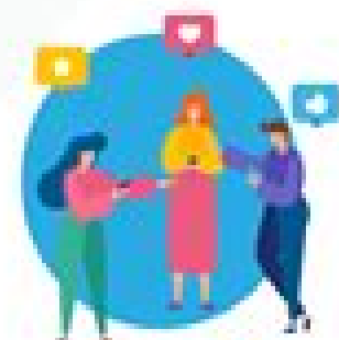
Friendly social network