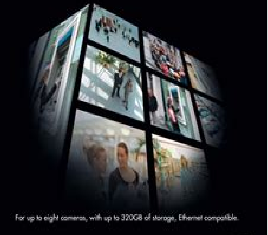
For up to eight cameras, with up to 320GB of storage, Ethernet compatible.

Digital Disk Recorders WJ-HD220 Series WV-HD220/32 (128GB HDD) WV-HD220/16 (160GB HDD)