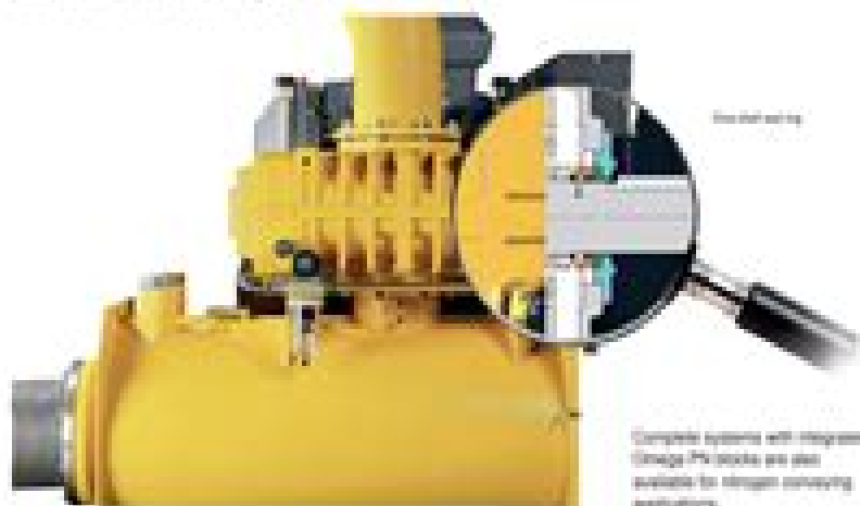
Complete systems with integrated Omega PN blower are also available for nitrogen conveying applications.

Leakages from all system components – including rotary blowers – should therefore be kept to an absolute minimum. For such applications, specially developed PN-series blowers are available with three different drive shaft sealing technology, as well as wear-free slide ring seals.