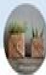
Home & Living