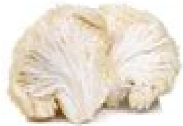
Lion's mane mushroom