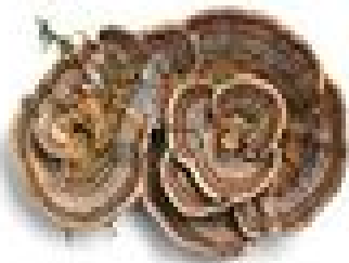
Turkey tail mushrooms