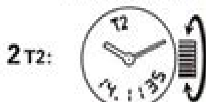
Second time zone