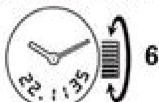
Hours + Minutes + Seconds