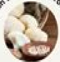
Lion's mane mushroom