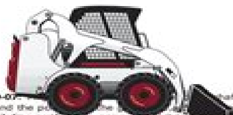
FIG. 2D-07: Insert the injection pump so that the notch line on the rear circumference of the injection pump gear is aligned with the mark shaped like an arrow point over the opening in the gear case. (Dead Center).

Remove bolts holding injection pump to timing gear case and remove injection pump assembly. Install injection pump as follows: