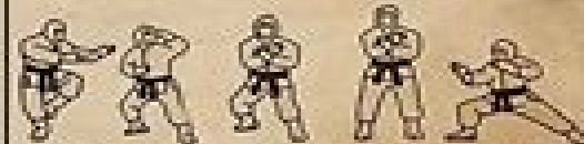
HICHO KOSEI JUMONJI HENKA JUMONJI KIKOU IKEN HOGI