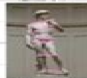
Gleichgewicht in Büchsenart