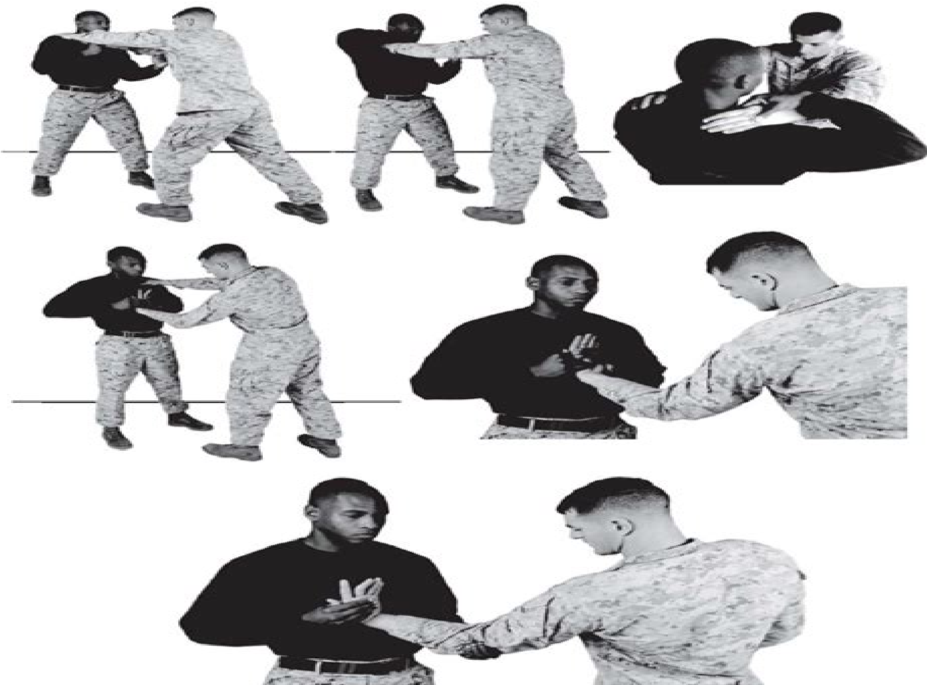
Figure 4-9. Enhanced Pain Compliance from a Basic Wristlock.