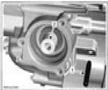
1. Splash plug 2. Crankshaft locking bolt