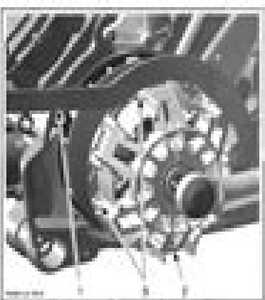
1. Clutch holding tool 2. Drive pulley locking nut 3. Clutch holding tool nut

CAUTION: Prior to removing the drive pulley, mark sliding rail and governor cup together to ensure correct reinstallation. There are only 4 grooves mounted out of 8 possible positions.