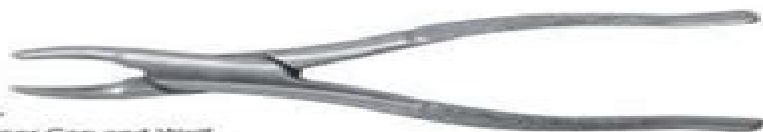
617 Incisor Cap and Wolf Tooth Forceps, T" S.S