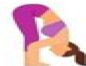
Standing forward bend