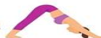
Downward facing dog