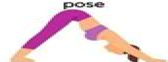
Downward facing dog