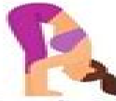
Standing forward bend