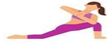
Revolved side angle pose