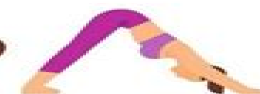
Downward facing dog