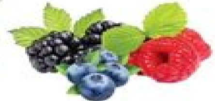
Berries 1/2 cup