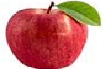
Apple 1 count