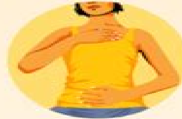
Anxiety relief meditation