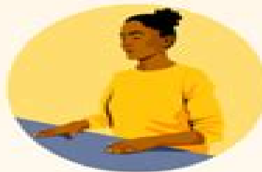
'Do nothing' meditation