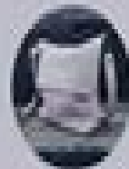
Home & Living