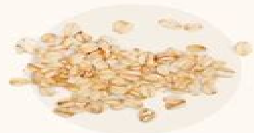
Oats and Barley