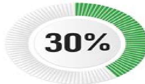
Reduced healthcare cost