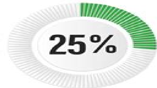
Decline in chronic diseases