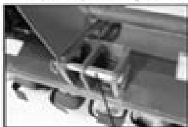
Cat 1 & 2 Step Pin w/Lynch Pin