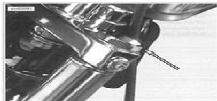
Figure 2-75. Fork Tube Cap