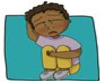
A GOOD CRY