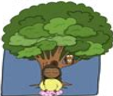
BE IN NATURE