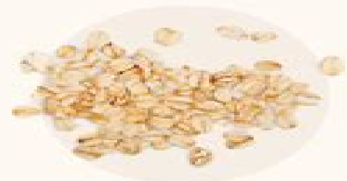
Oats and Barley