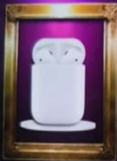
Airpods 2nd Gen