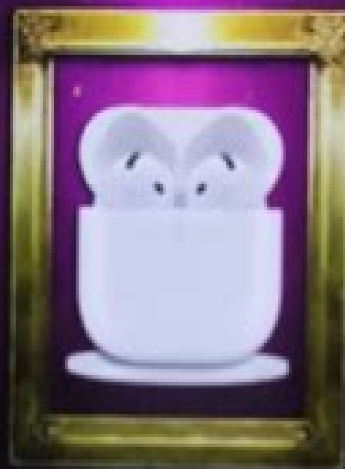
Apple AirPods 4