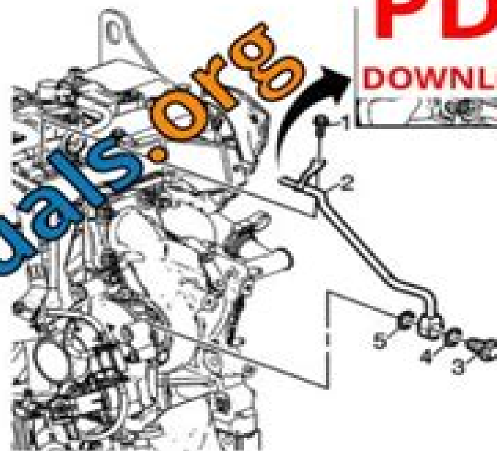
Fig. 14: Camshaft Cover Heat Shield Bolt